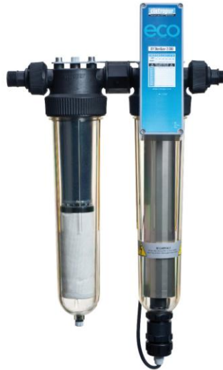
TIO-UV & TIO-UV-eco