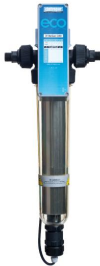
2000 & 2000 eco