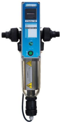
1000 & 1000 eco