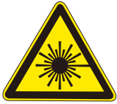
Radiation warning sign

According to regulation in EN60825-1 standard , each 3R laser product must be accompanied by a radiation warning sign and a radiation declarative sign.